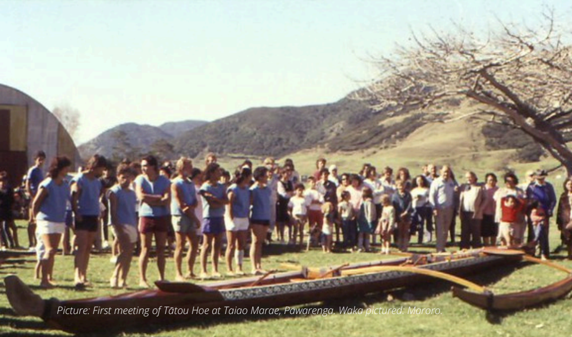
Picture: First meeting of Tātou Hoe at Taiao Marae, Powarenga. Waka pictured: Maroro.